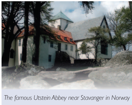
The famous Utstein Abbey near Stavanger in Norway

This call to action declares the current situation to be unacceptable and states: